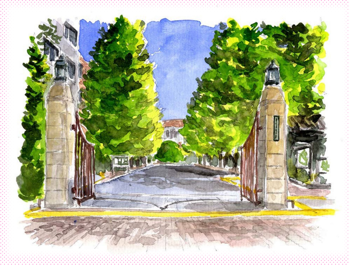
Main gate of Ochanomizu University