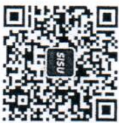
Official Wechat Account